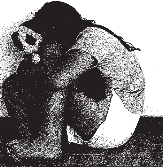
Intimate partner sexual assault is associated with more severe depression, anxiety, and behavior problems in the children of adult victims.